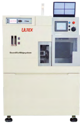
SCS Lab system