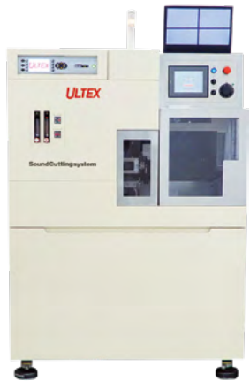
SCS Lab system