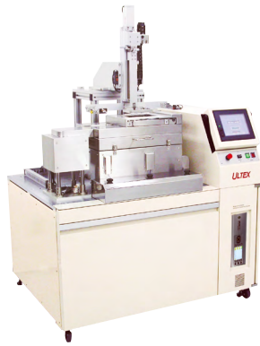
CSS Lab system