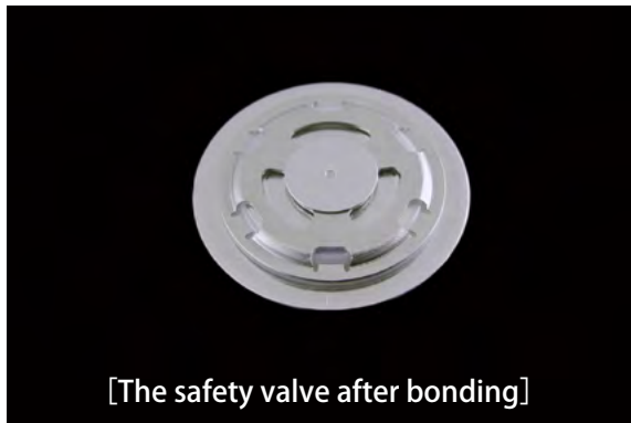
[The safety valve after bonding]