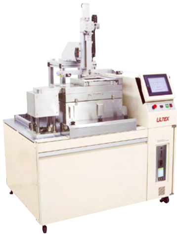
Cavity Soldering System/CSS

Nickel terminal • Non-flux • SoundSoldering