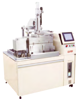
Sound Cavity Soldering System/CSS